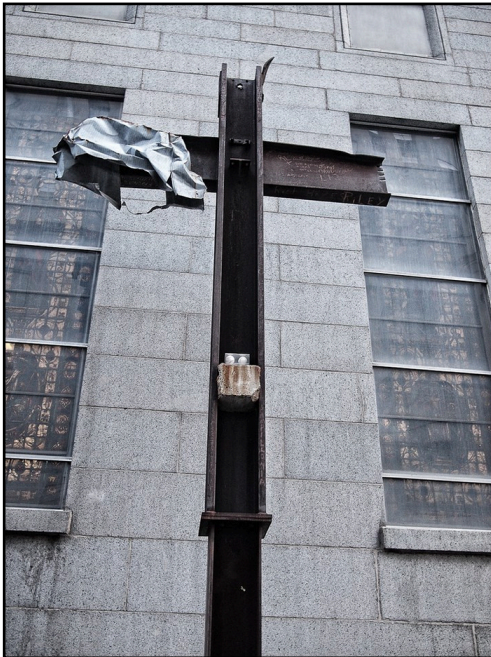
Cross standing on the street in New York City, just outside of Ground Zero, 2001.

Our secondary purpose is to serve our community in crisis intervention, emergency situations, and as the public needs through 911 calls.