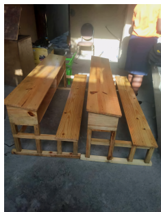
New Desks for Children

“Pure and undefiled religion before God and the Father is this: to visit orphans and widows in their trouble.” James 1:27