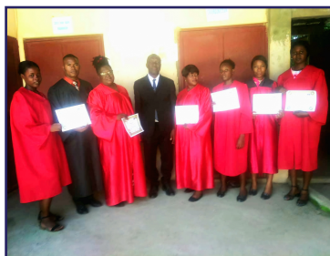
School of Evangelism Graduates