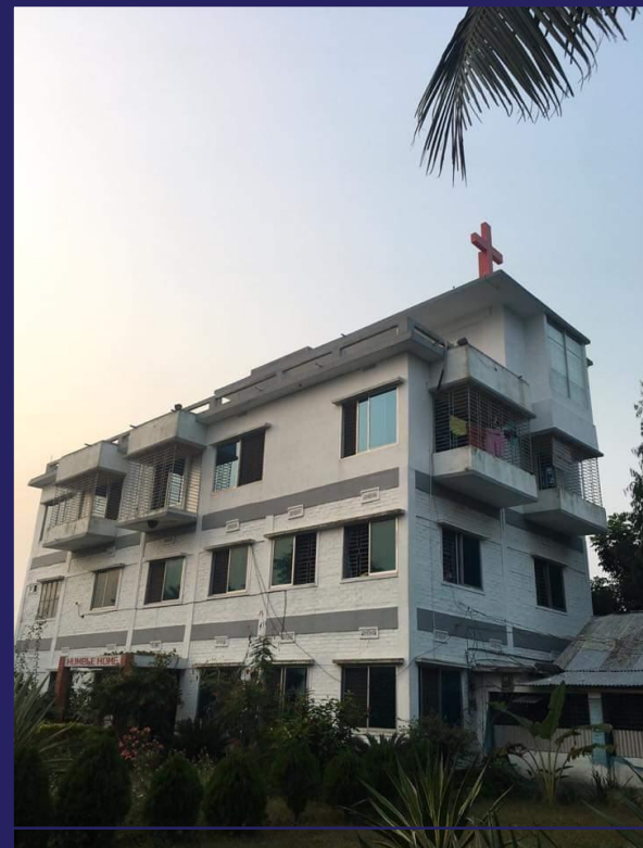
Humble Home in Bangladesh

501 Johnson Street / PO Box 412 Russellville, KY. 42276