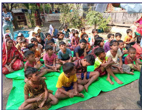
Sunday School in Bangladesh