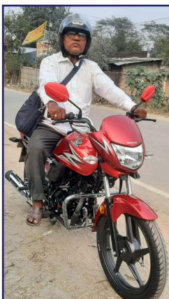
Evangelist in Bangladesh with New Motorcycle