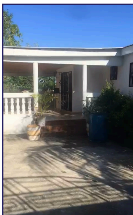
House of Love